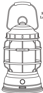
A Forest Lantern